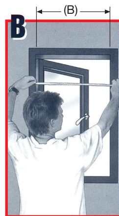
(B) From the inside left to the inside right of the frame - The width (B)

For TOP HUNG WINDOWS, simply reverse the measurements ie. use the height as the width and the width as the height.