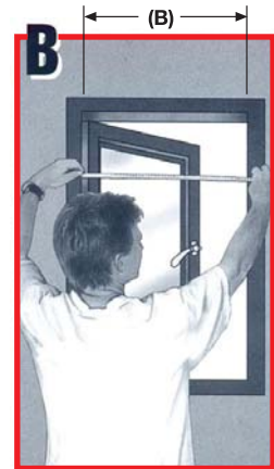
From the inside left to the inside right of the frame - The width (B)

For TOP HUNG WINDOWS, simply reverse the measurements ie. use the height as the width and the width as the height.